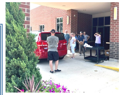
SEPTEMBER 2024 pekingrace.org

Indeed, snack packs nourish the bodies of hungry children while giving them some security to have extra food at home (or at school when there are no snacks to bring from home for their midday snack). Equally important, the packing of snack packs allow volunteers to be Jesus' workers and feel gratified as they are helping children, families, and our community!