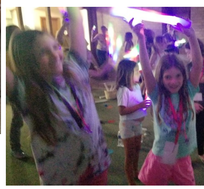
AUGUST 2024 pekingrace.org Page 6