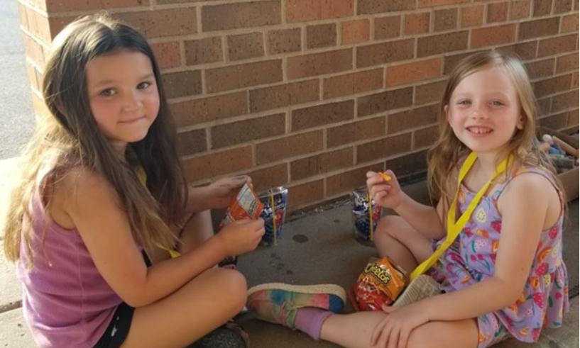
THANK YOU VBS VOLUNTEERS!!!!