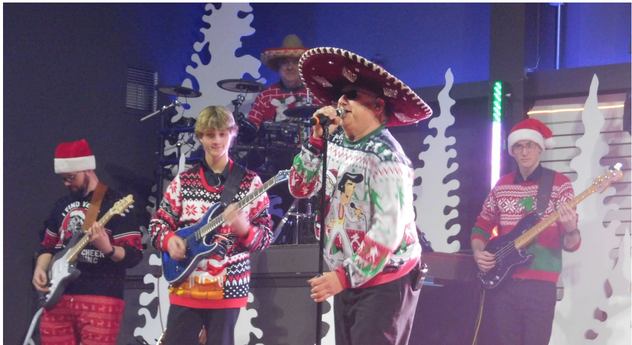
Evening by the Fire - This was a wonderful and fun event. If you missed it, you will have to make plans to come next year!