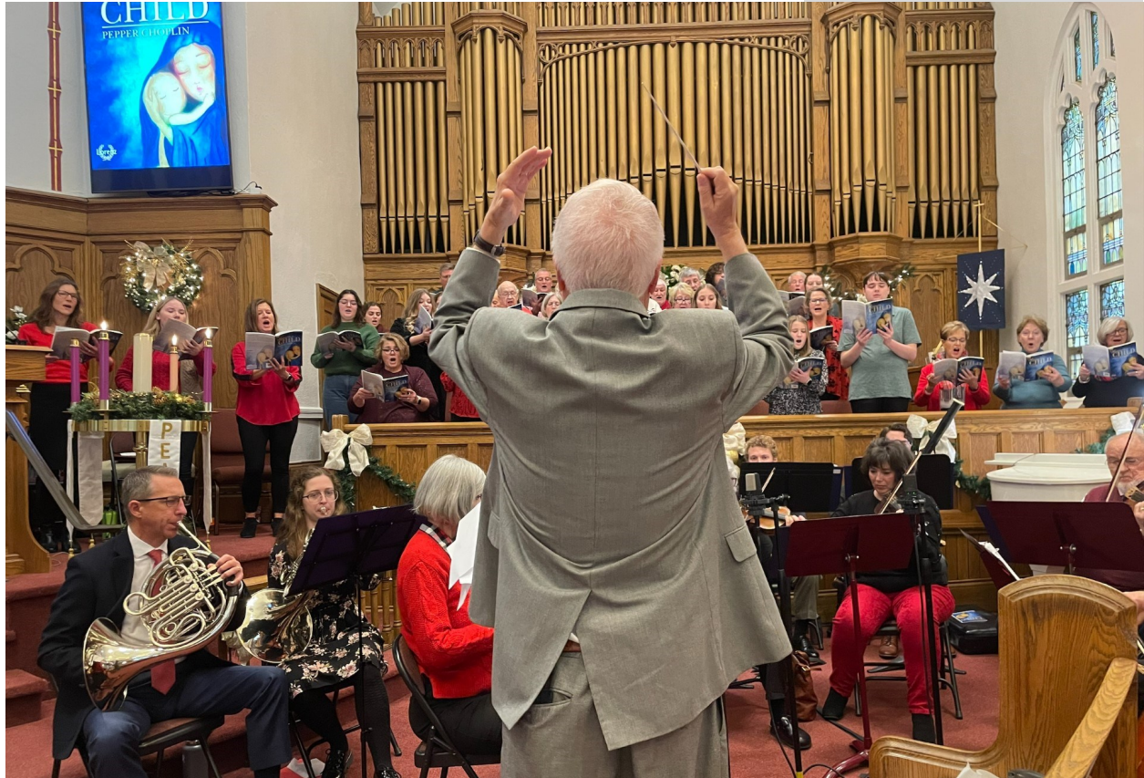
Sanctuary Choir Christmas Cantata: Heaven's Child - If you missed this wonderful presentation you can find it on all our online places and the Grace app.